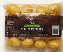
B-Size Organic Yellows 7 77586 70036 4