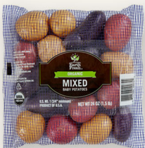
Mixed Organic Baby Potatoes 7 77586 10074 4