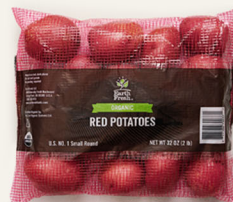
B-Size Organic Reds 7 77586 70037 1

CREAMERS CONTINUE TO DEMONSTRATE CONSISTENT YOY GROWTH, NOW ACCOUNTING FOR 20% OF POTATO SALES $