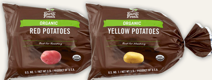
3-lb Organic Reds 7 77586 70037 1

Source: Nielsen Discover, L52Weeks — Period Ending December 27th, 2024